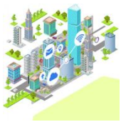
Track 1: Structural Engineering and Materials

All papers must be original and not simultaneously submitted to another journal or conference. We welcome Full Research papers, Full Review papers and Posters from the following four tracks, but not limited to