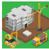
Track 2: Construction and Urban Development