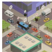
Track 4: Transportation and Computations